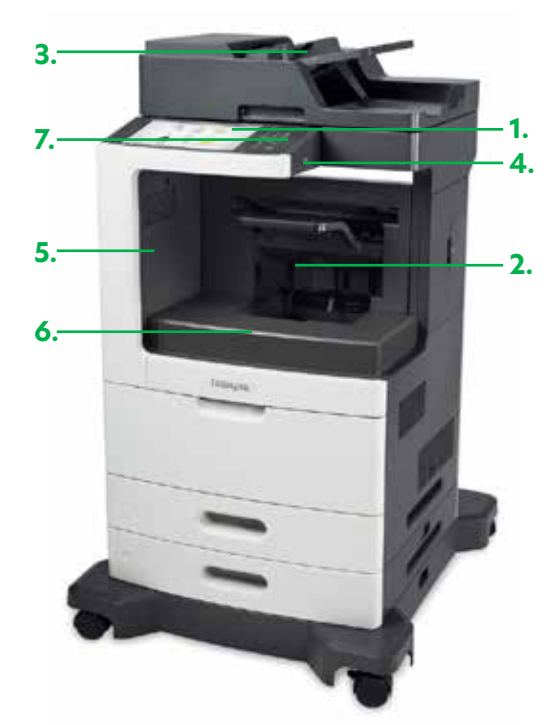
XM7170 model configured with Staple, Hole Punch Finisher

Choose from multiple output options, including a four-bin mailbox, an offset stacker, a staple finisher and a staple with hole punch finisher.