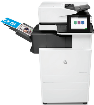
HP Color LaserJet Managed MFP E87660dn

Businesses that stay ahead don't slow down. It's why HP built the next generation of HP Color LaserJet MFPs—to power productivity with a streamlined design that delivers premium color value, maximum uptime, and the strongest security. 1