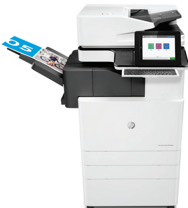
HP Color LaserJet Managed Flow MFP E87660z