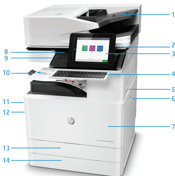
HP Color LaserJet Managed Flow MFP E87660z