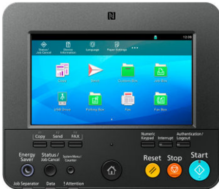
TASKalfa 508ci / 408ci / 358ci control panel